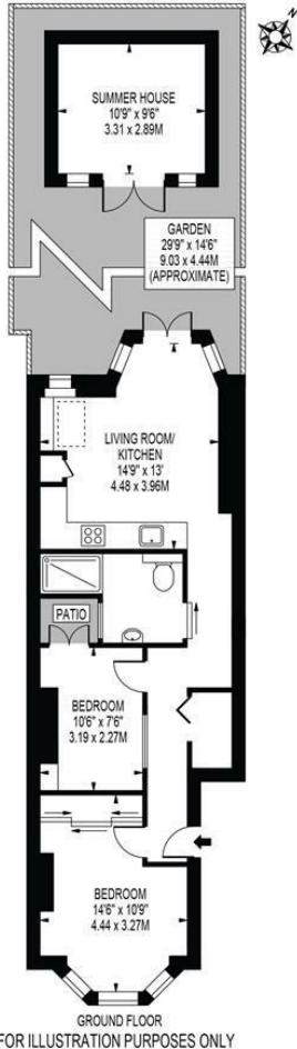
GROUND FLOOR FOR ILLUSTRATION PURPOSES ONLY

COWPER ROAD APPROXIMATE GROSS INTERNAL FLOOR AREA: 550 SQ FT - 51.09 SQ M (EXCLUDING SUMMER HOUSE) APPROXIMATE GROSS INTERNAL FLOOR AREA OF SUMMER HOUSE: 103 SQ FT - 9.57 SQ M